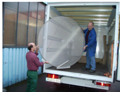
Pickup and delivery service