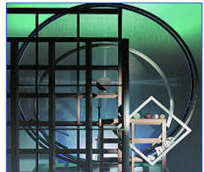
Screen frames and rings