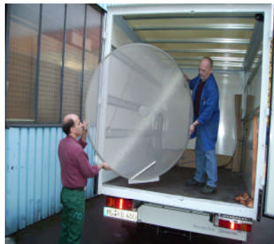
Delivery and pickup service