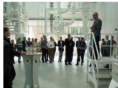
Dedication of the new production building