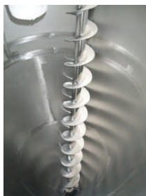
View into a mixing system